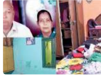
Double murder in Delhi leaves locality i...