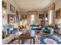
Grand English Country Manor Poised for...