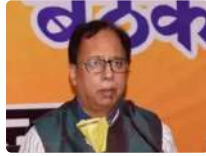
Former JD(U) MP meets Bihar BJP chie...

/https/ xai=AK HlQBg hENwI lOZftot YRuiAt Y3mw NppA4 fu_SZT [qw_fb NEWS/