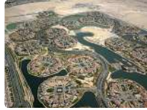
Prices of villas in Dubai might surprise you!