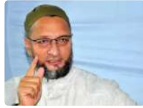
K'taka: AIMIM releases first list for assembly...