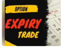
90% Profit on intraday trade Auto buy sell...